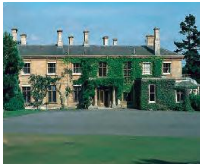
The Mary Hare School